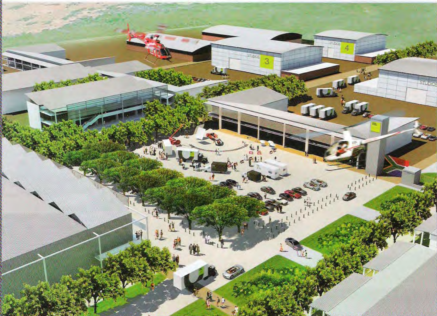
CTFS Arch perspective birds eye

The thrilling new vision for the Cape Town Film Studios (CTFS) was unveiled to film industry stakeholders at an exclusive event on the 1st December, 2008. CTFS is the first custom-built, Hollywood-style studios in South Africa's history, boasting residential and commercial properties. The event took place on site in Faure, a secluded area 20km outside of Cape Town, where Phase 1 of construction is underway. It was a golden afternoon of movie magic and action-packed stunts but also an intimate event beset with nostalgic music. Distinguished guests included representatives from all of South Africa's most notable film companies. Regrettably, due to it being 'peak season' in the industry, not all of the invited guests could attend as many were on